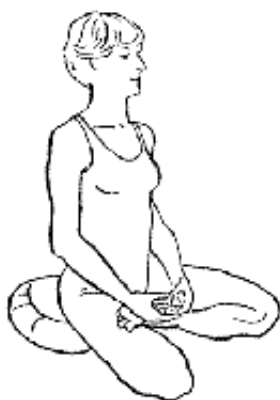
Breathing in Zazen

It is important to center your attention in the hara. The hara is a place within the body, located two inches below the navel. It's the physical and spiritual center of the body. Put your attention there; put your mind there. As you develop your zazen, you'll become more aware of the hara as the center of your attentiveness.